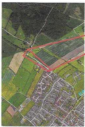
Google Earth Image Site Identification Plan 1

HAZARDOUS ACTIVITY LEADING TO UNUSUAL, SIGNIFICANT OR UNUSUAL CONSTRUCTION ARE IDENTIFIED ON THIS DRAWING AS: The following activities are identified on this drawing as being hazardous or unusual, significant or unusual construction activities. It is acknowledged that the nature and extent of these activities may vary during the course of the project and it is recommended that the contractor should consult with the relevant authorities and the relevant legislation to ensure that all necessary permissions are obtained. It is also recommended that the contractor should consult with the relevant authorities to ensure that all necessary permissions are obtained.