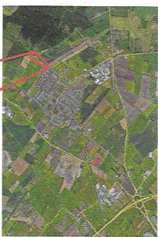
Google Earth Image Site Identification Plan 2