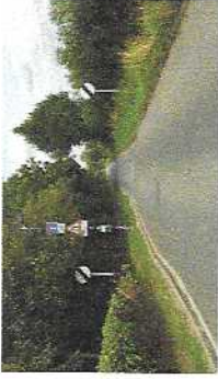
Image 4 - Access Road change to single track access